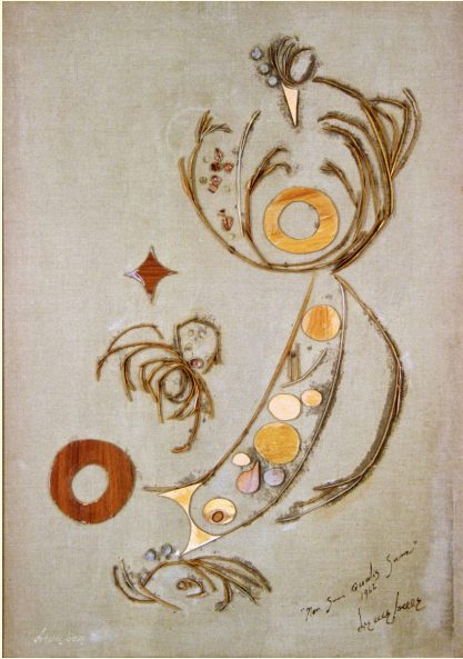
Non Sum Qualis Sume , 1962 Mixed Media